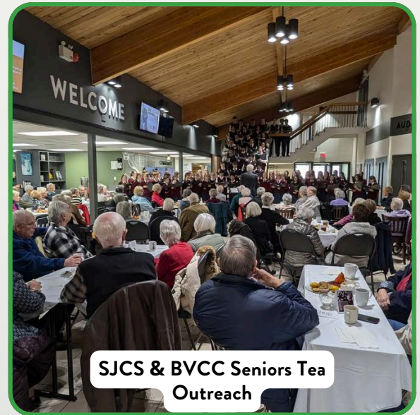
SJCS & BVCC Seniors Tea Outreach

For decades, Young at Heart (YAH) was Bow Valley’s group for seniors. In the past year, we have begun to refer to “Young at Heart” events as “Seniors” events. The long-standing Young at Heart potluck is now the Seniors Luncheon with food provided by the leadership team. There are also Seniors Bible studies and Community groups each week.