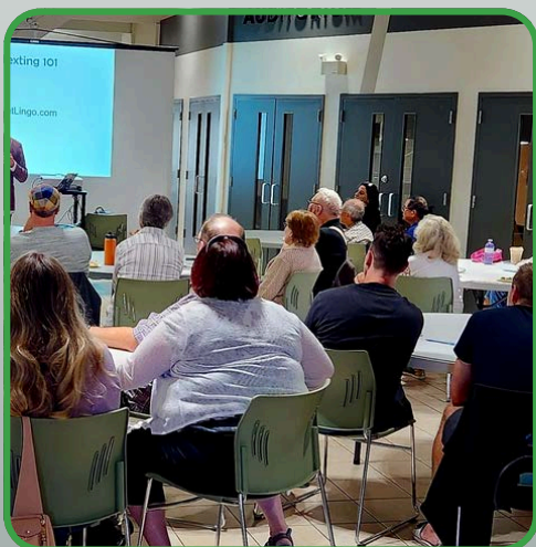
Empowering Parents in the Digital Age

For our parents, we added many new ministry opportunities. One highlight was a group of fathers and sons participating in our newly developed 6-month program called Journey to Manhood. The program helps fathers intentionally disciple their sons and guide them through the transition from boyhood to manhood. We also had a group of parents participate together in Family Life Canada's Parenting Conference in April, where they attended a series of workshops designed to educate and equip them for the challenges of Christian parenting. In September we welcomed a guest speaker who provided valuable insights and guidance on raising children in today's rapidly evolving digital world.