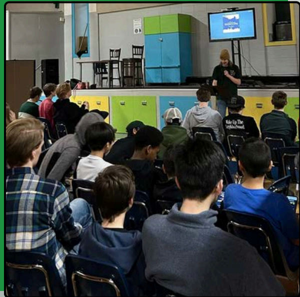
BVCC Youth Friday Night Teaching and Small Groups