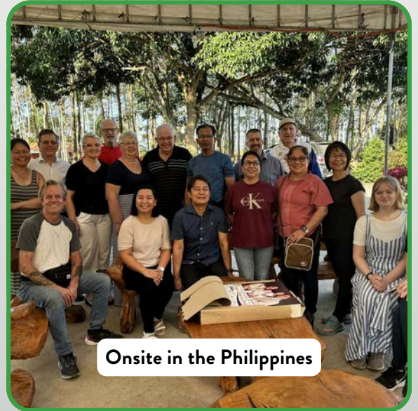
Onsite in the Philippines