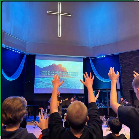
BVCC Youth Monthly Worship Nights