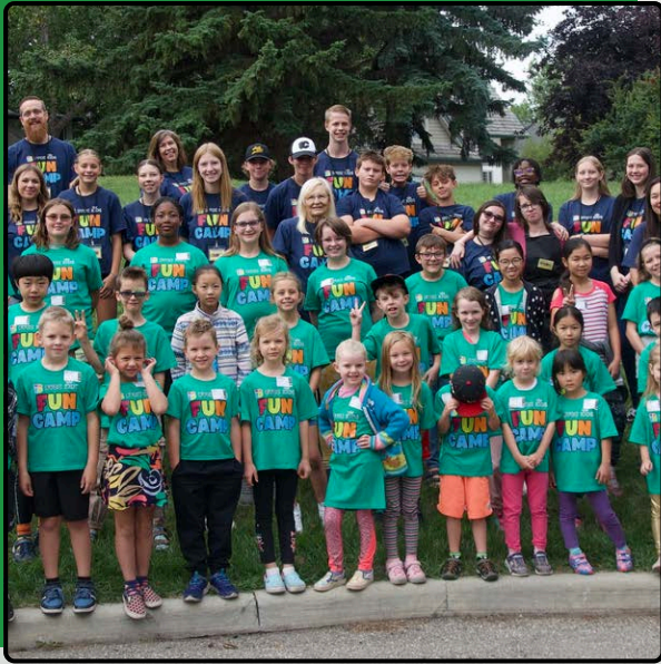
BVCC Fun Kids Camp