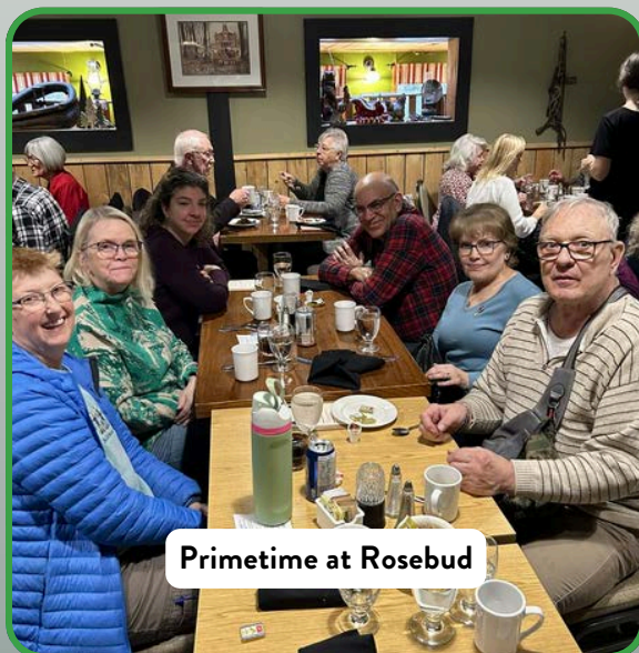
Primetime at Rosebud

Because a sixty-year-old senior has different interests and abilities than 80- and 90-year-old seniors, we have a second ministry to seniors known as BVCC PrimeTime. Within PrimeTime there are activities and groups designed to create belonging: Coffee, Conversation & Games, Pickleball, Rosebud Theatre trips, and Dinner Clubs. Leading and participating in Bible studies, the Grandparenting Matters seminar and the Aging Matters seminars keep seniors growing and investing in others.