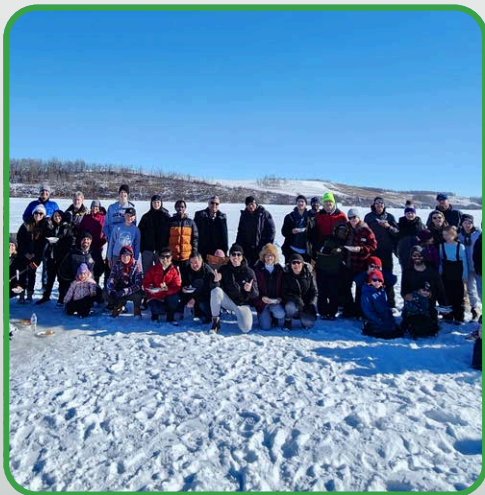
Family Day at Pine Lake

2024 was a year full of new opportunities and kingdom impact in our Family Ministry. BVCC Kids had an average of 53 kids attend each Sunday and our volunteer team grew to more than 60 members, helping us to smoothly transition to two services in September. BVCC Youth had an average of 47 youth attend our Friday night ministry and we deepened our sense of belonging and spiritual growth by adding Saturday gym drop-ins and Sunday Bible studies. In total, 9 kids and youth made the decision to follow Christ and be baptized in 2024.