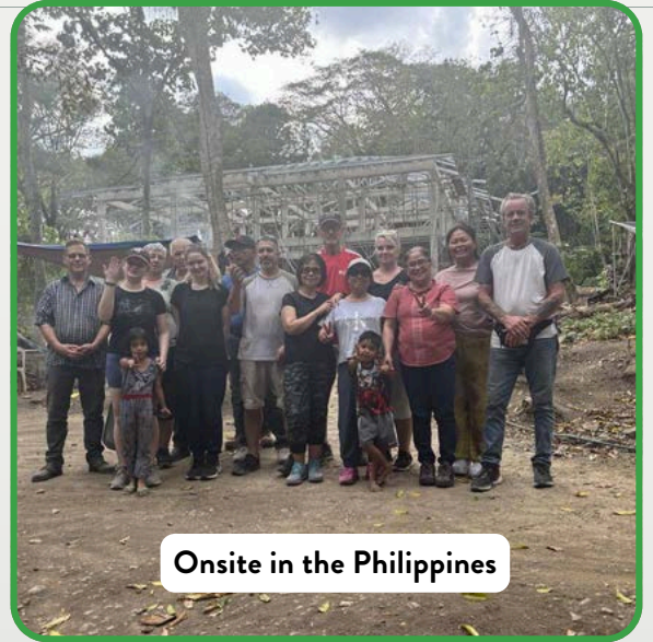
Onsite in the Philippines