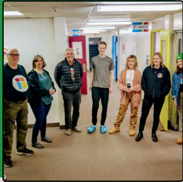
BVCC Kids' Volunteer Team Pre-Service Prayer Meeting